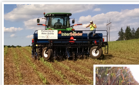
Cover crop planted with Interseeder™: